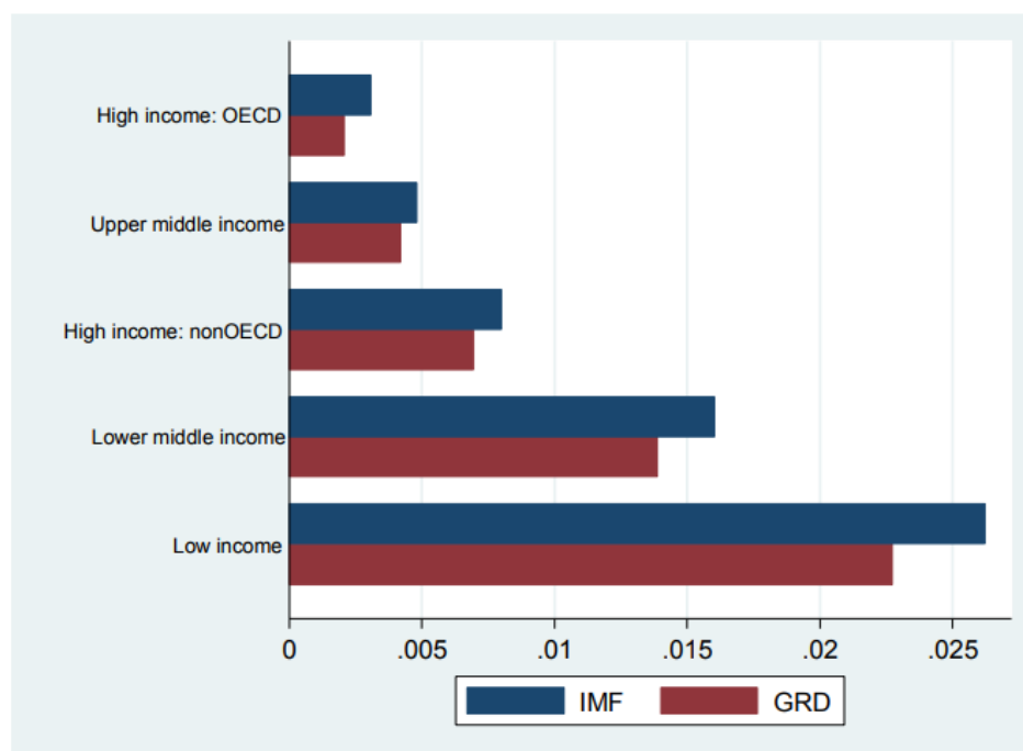
Graph 1: Average losses/GDP per region and income

Note: Means of IIMF and IIGRD refer to mean values of revenue loss estimates using IMF and GRD data, respectively.